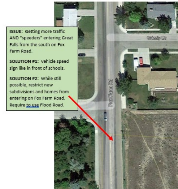
Fox Farm Road – Traffic Entering from South of Town

With so much growth going on south of Great Falls that is increasing the use of Fox Farm Road, I would REALLY like to see if there is any chance to discuss ideas to deal with some issues before the master plan is finalized. Safety concerns with increased traffic and congestion, especially at 10th and Fox Farm are the primary areas I would like to discuss. Attached are some possible projects that "I" think can be accomplished before completing/incorporating the new traffic plan. I realize easier said than done but worth a shot. Thanks, Al Rollo